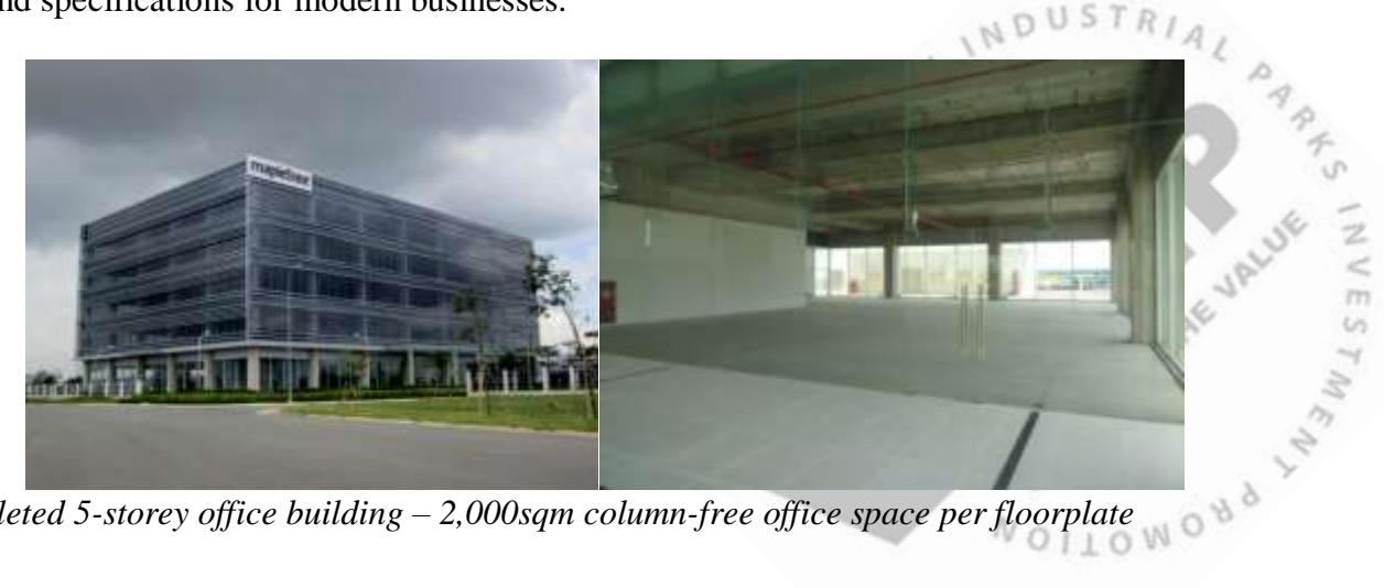
Completed 5-storey office building – 2,000sqm column-free office space per floorplate

MBC@BD is located 30km from Ho Chi Minh City and TanSonNhatInternationalAirport , or a mere 45 minutes' drive away, in the southern province of Binh Duong, one of Vietnam's fastest-growing provinces. The strategic positioning of MBC@BD in Binh Duong New City as the centre of the Southern Key Economic Zone, further complemented by ample amenities such as retail and F&B options, has attracted multinational corporations. This has in turn driven demand for quality business spaces. Meeting this need for quality real estate is MBC@BD, which features a contemporary modular infrastructure that offers its users a comprehensive suite of solutions, from ready-built facilities to build-to-suit options. These products feature efficient layouts and high-end specifications for modern businesses.