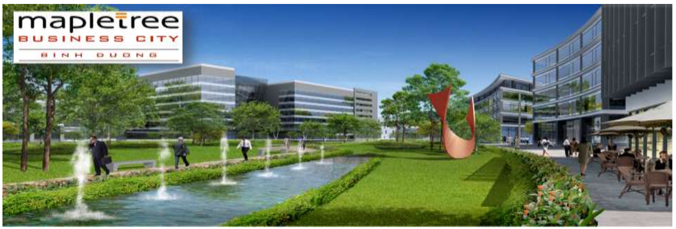
Artist's Impression of the MapletreeBusinessCity (a), Binh Duong.

The award-winning Mapletree Business City (MBC) concept is raving up in Vietnam. Modeled after Singapore's MBC, the 75hectare MapletreeBusinessCity @ Binh Duong (MBC@BD) is a large-scale premium development built to serve the needs of modern businesses and high-tech ventures alike.