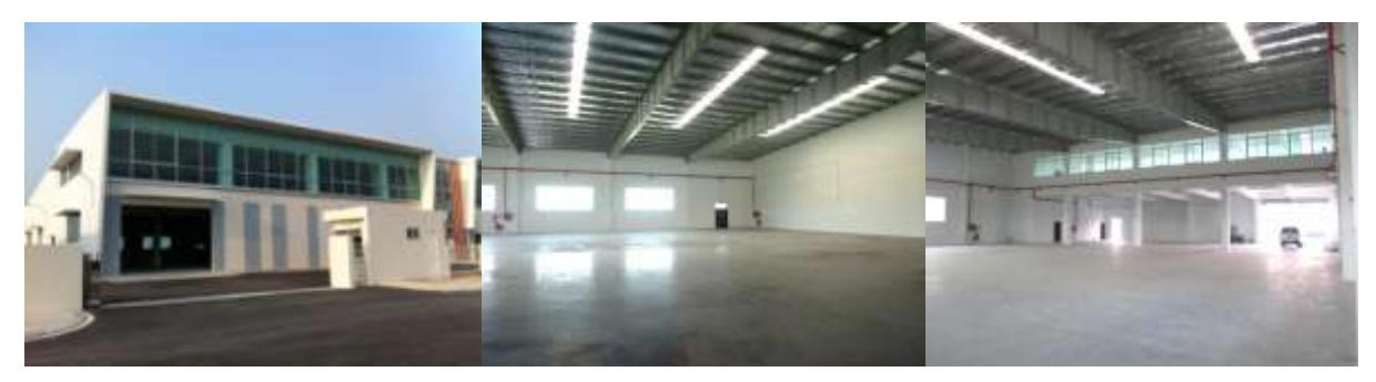
RBBS2000 factories: 2,000sqm of column-free production and floor-to-ceiling glass windows at mezzanine office